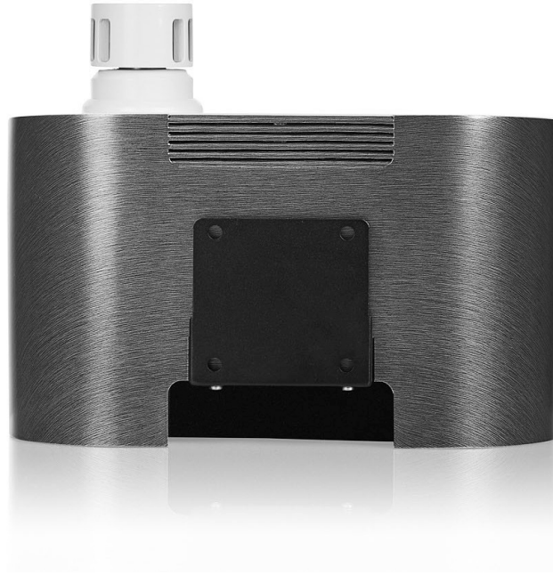
Abb. 3: AQ Guard Ambient mounting AQ Guard Ambient features a robust, attractive weather shield and can be combined with a multitude of mounting systems by a VESA compatible bracket. Special ruggedized versions for hazardous environments are available on demand. AQ Guard Ambient records air temperature, pressure and relative humidity with integrated sensors. Additional sensors for gaseous pollutants are in development.